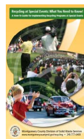
Maryland Recycling Network