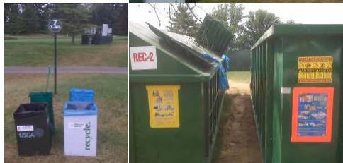
Maryland Recycling Network