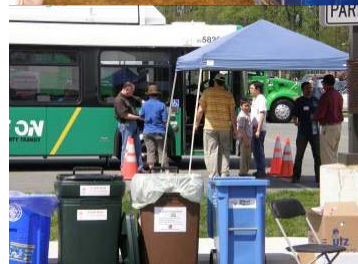
Maryland Recycling Network