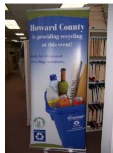
Maryland Recycling Network